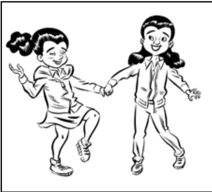
The girls are so excited as they walk to the concert