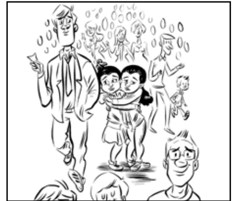
They are so scared